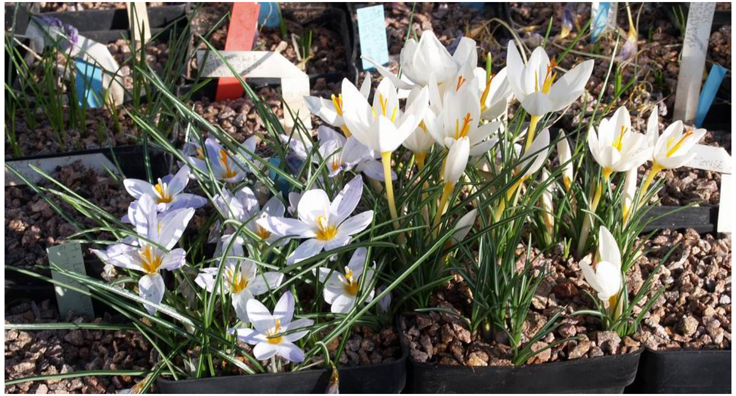
Crocus laevigatus and Crocus niveus

It only takes a few hours of sunshine to warm the bulb house enough to bring the next batch of Crocus species into bloom. On the right is a later flowering, shorter, form of Crocus niveus with the first flowers just opened.