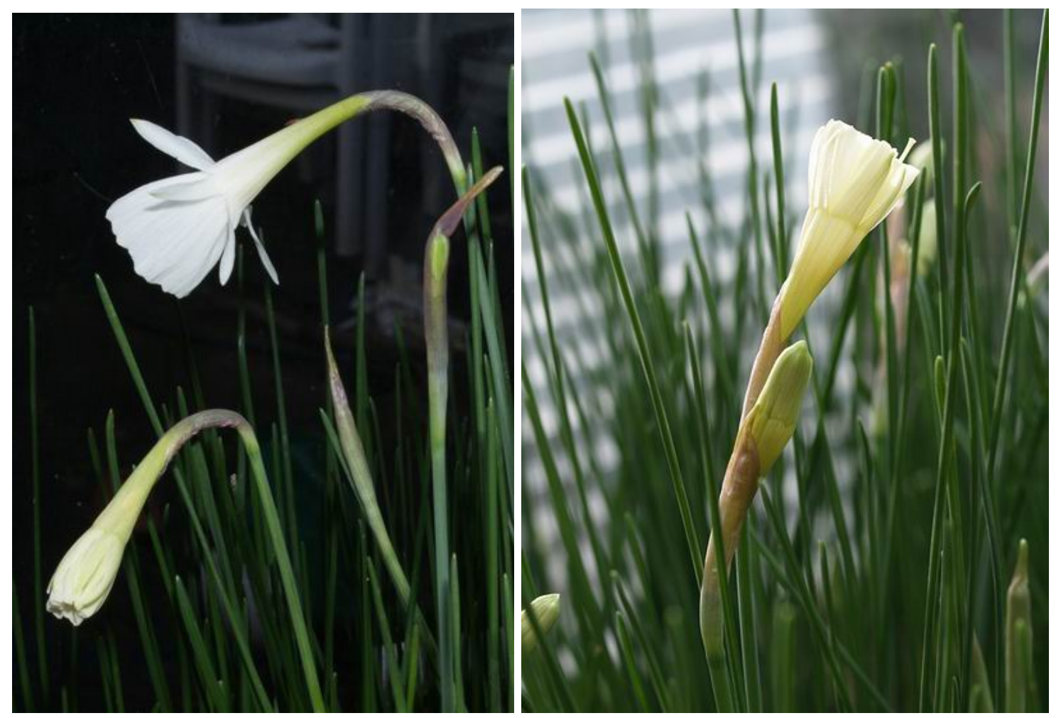
Narcissus cantabricus foliosus

This time of the year sees many gardeners preparing for the long winter shut down while I see it as the start of another twelve months of growing and flowering. My 'year' starts with the 'September storm' which coincides with the time I sow much of the seed I have collected over the year, that is followed with the early flowering autumn bulbs; firstly Colchicum,Crocus and Sternbergia, with the 'winter' flowering Narcissus following on.