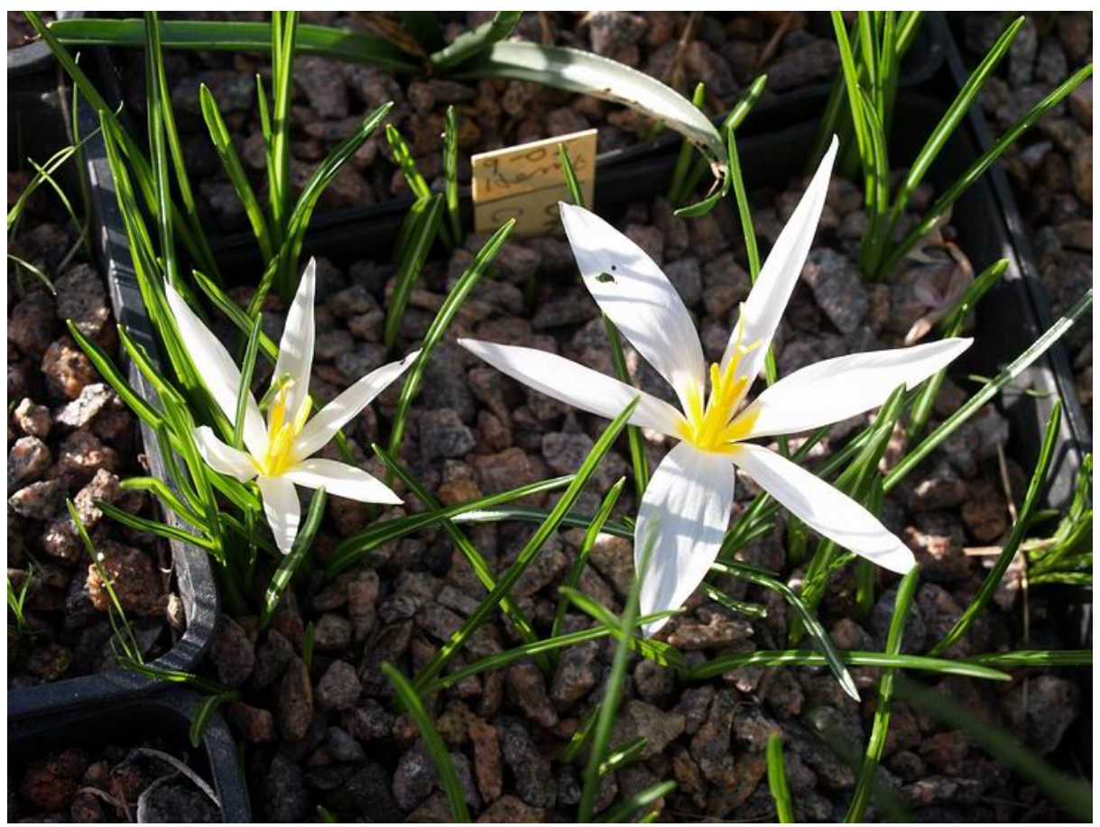
Crocus caspius seedlings

These are the first flowers, from a pot of seed from the above plant, sown in September 2005 and you can see that they too have inherited the narrow segments. Four years from seed to flower is a good bench mark for raising Crocus. When grown in optimum conditions it can be done in three years but these have not been repotted since sown – ideally they should have been repotted after their second year of growth. They have had additional feeding mostly in the form of potassium.