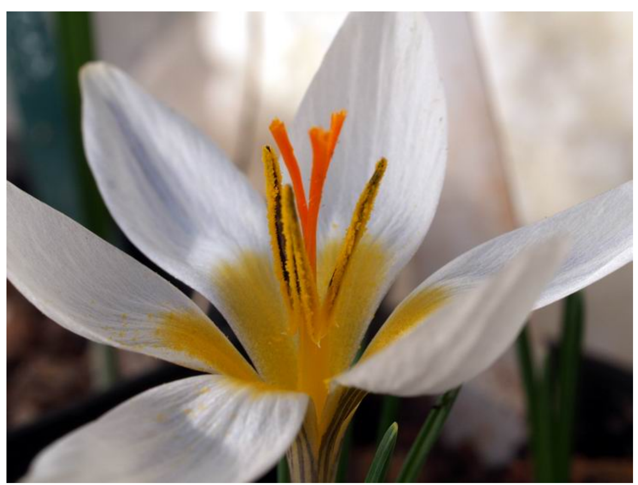
Crocus biflorus melantherus

Superficially the flowers of some forms of Crocus hadriaticus can look very similar to those of C. niveus and sometimes these species appear mixed up as their corm tunics are both finely reticulate.